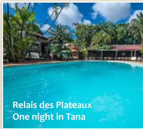
Relais des Plateaux One night in Tana