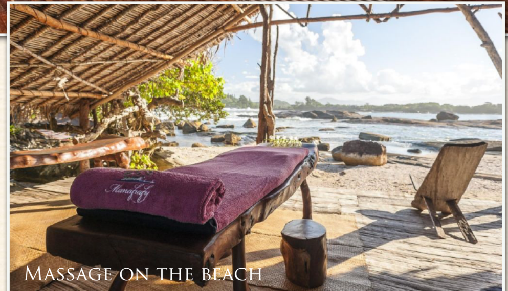
MASSAGE ON THE BEACH