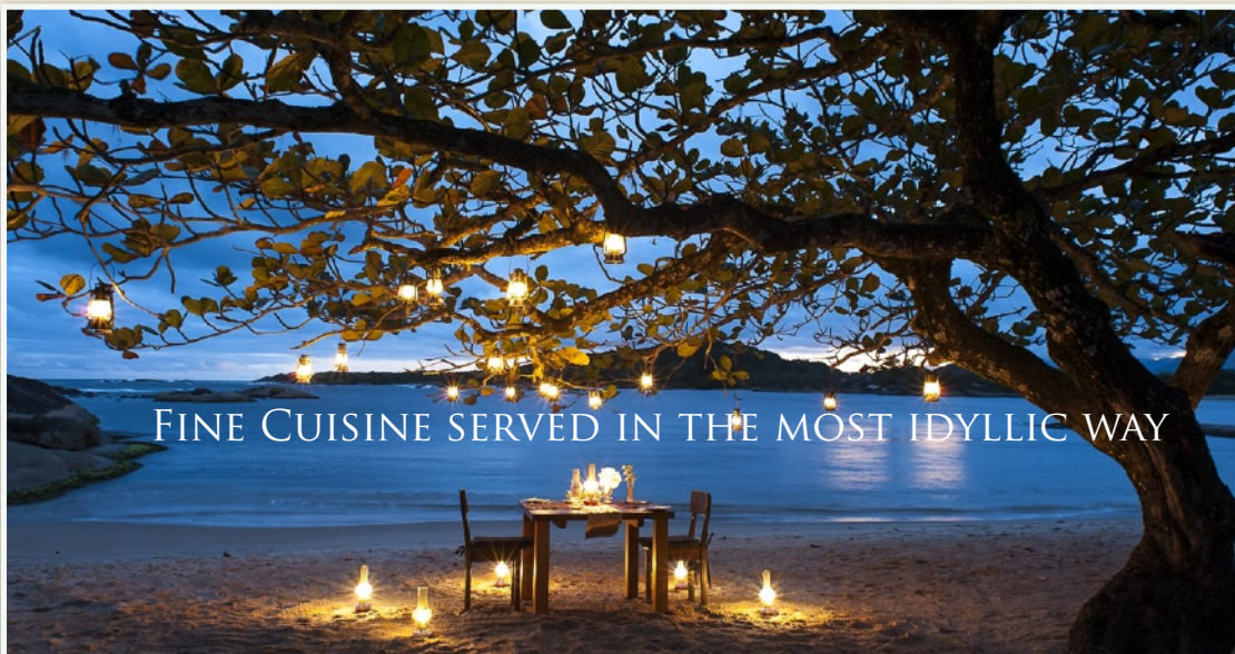
FINE CUISINE SERVED IN THE MOST IDYLIC WAY