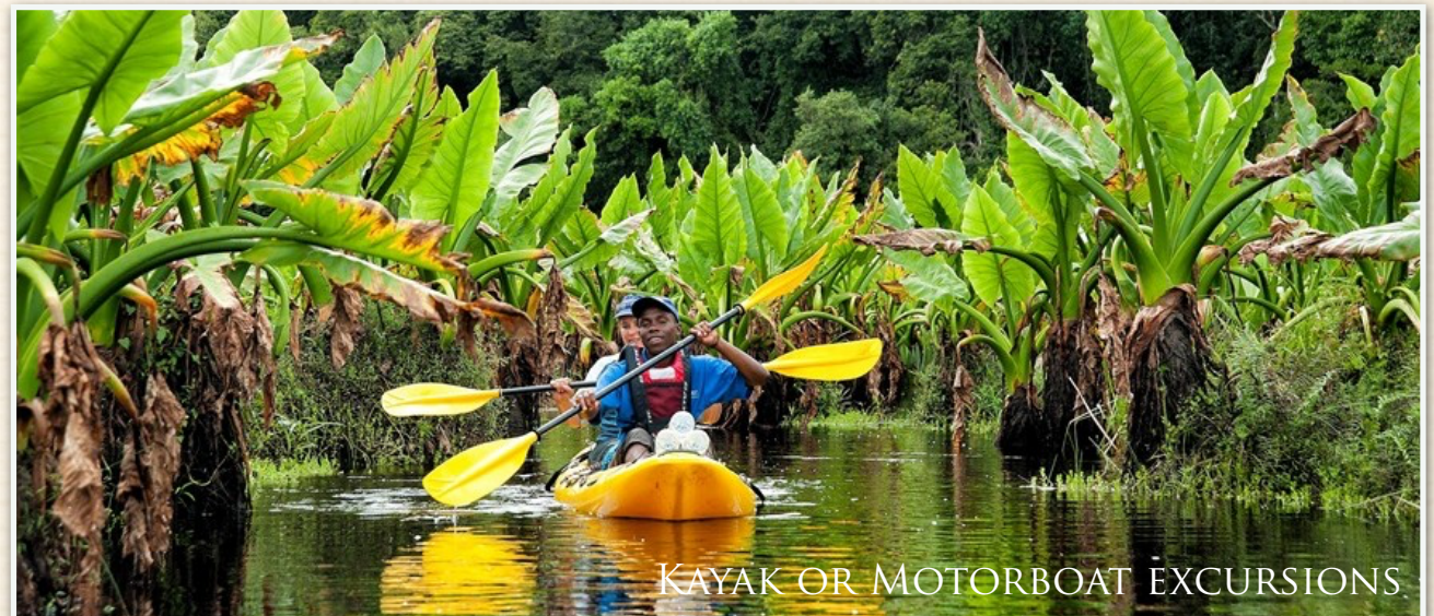
KAYAK OR MOTORBOAT EXCURSIONS